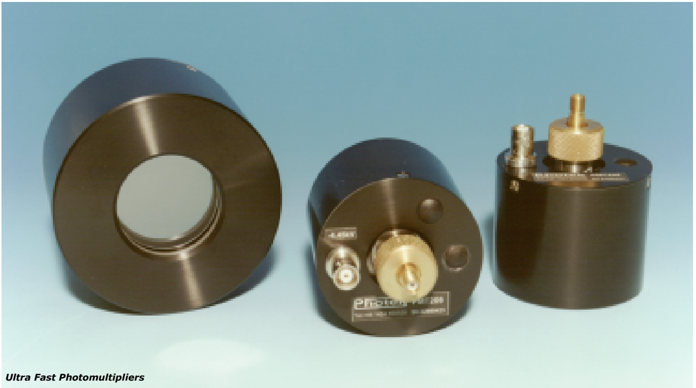
Ultra Fast Photomultipliers